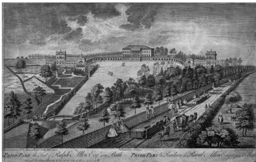
FIG. 1. Famous 1750 print of Prior Park ('Anthony Walker Sculpt').

The jewel of the Allen empire was the Palladian mansion at Prior Park (Fig. 1). The house was built by John Wood, the Elder, starting in the 1730s. It had a grand imposing façade and enjoyed breathtaking vistas of Bath from its vantage point at the top of a hillside just southeast of the city. But Prior Park was built on a hilltop 'not only to see all Bath but for all Bath to see'. 25 The house on the hill's crest and its sloping gardens that rolled towards town were intended as visible markers of Bath's prosperity. To achieve maximum visual impact, Allen employed major talent in the design of his gardens. He initially sought the advice of Alexander Pope, and soon William Kent weighed in on further improvements. Over the years Allen added structures and satellite buildings. Most widely known, perhaps, is the copy of a much-admired Palladian bridge (the original was designed by Pembroke in the late 1730s), constructed in the 1750s to stretch over a sculpted pond at the bottom of the landscape garden. But there were also some lesser-known touches. For example, Mrs Allen apparently began construction on a grotto in the 1740s, possibly under the influence of Pope's passion for such garden features. 26 Over the Ralph Allen years a pinery, a cascade, an octagonal stone hut, an outdoor room called the Grass Cabinet, a 'sham bridge', a Gothic Temple, serpentine walks and a serpentine lake, a pair of gatehouses, and various other embellishments sprouted up on the lawns facing Bath. 27