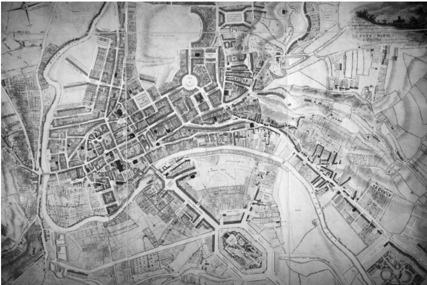
FIG. 4. Detail of the Bathwick area in the 1808 version of 'The City of Bath' map by Charles Harcourt Masters.