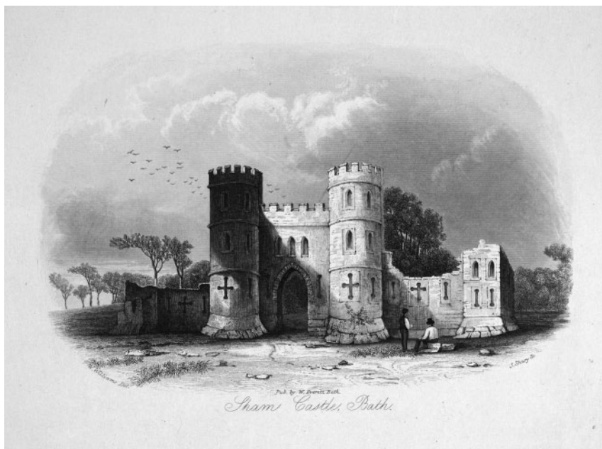
FIG. 7. Ralph Allen's Sham Castle, as depicted in an 1844 plate.