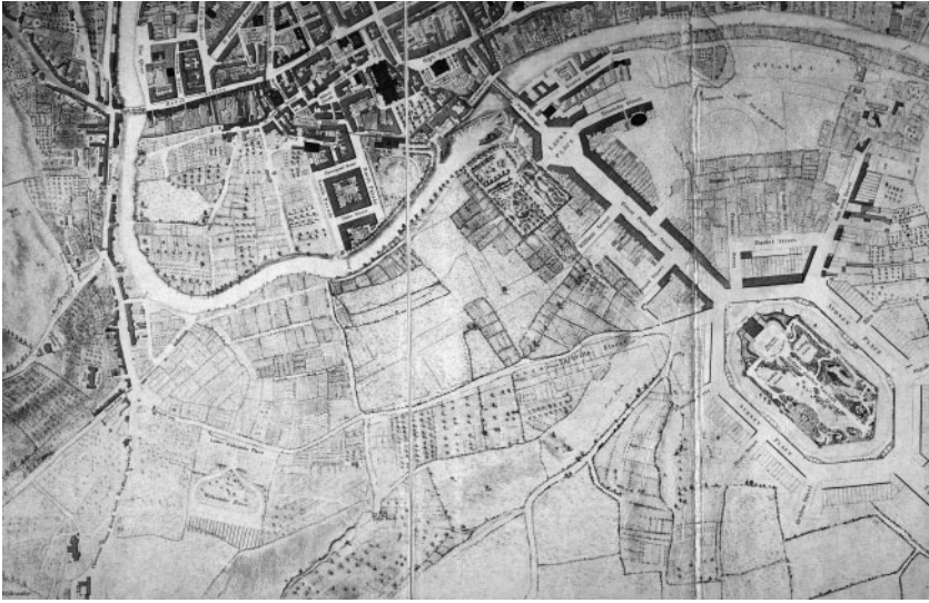
FIG. 3. Detail of the Bathwick area in one of the most detailed maps of the time, 'The City of Bath' by Charles Harcourt Masters (1794). It was reprinted with minor revisions in 1808 (see next figure). This 1794 imprint reads: 'Published by C. Harcourt Masters, Rivers Street and engraved by S. I. Neele, No 352 Strand, London. Sold also in Bath by all the Booksellers.'