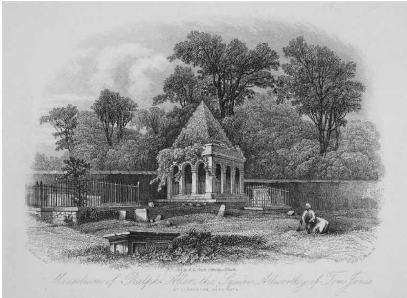
FIG. 2. Nineteenth-century print of the 'Mausoleum of Ralph Allen, the Squire Allworthy of Tom Jones'.

Thorpe, who soon rails against Burney's Camilla (1796)—a novel for which Austen was an original subscriber—by saying 'I took up the first volume once and looked it over, but I soon found it would not do', may be in the habit of reading only the beginnings of books (p. 43). His literary opinion likely does not matter much. Yet it was precisely the opening chapters of Tom Jones that were scrutinised most closely for Fielding's fictionalized portrait of Allen.