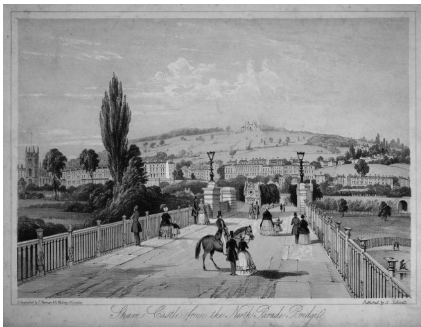
FIG. 8. 'Sham Castle from the North Parade Bridge', a print circa 1850.

1921 possibly tidied and repaired Allen's 'strange building' to excess, making a faux medieval castle look disturbingly new, it remains a noteworthy architectural oddity. 43 Today, Allen's folly ornaments a private golf course.