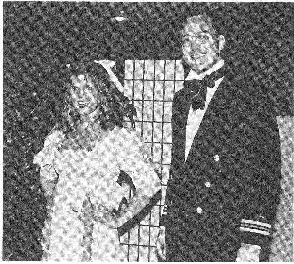
"These would have been all my friends . . ." A charming couple.