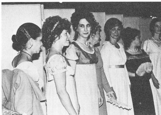
"Oh! she is the most beautiful creature I ever beheld!" Several beautiful creatures modelling the fashion show.