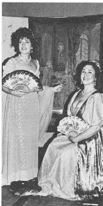
A scene from Which is the Man?